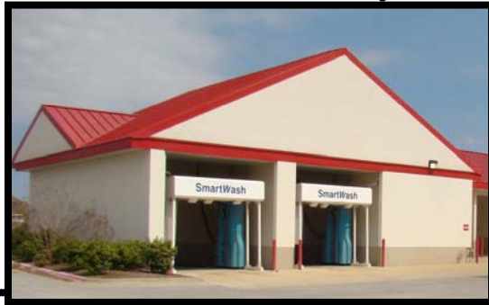
2 Automatic Bays